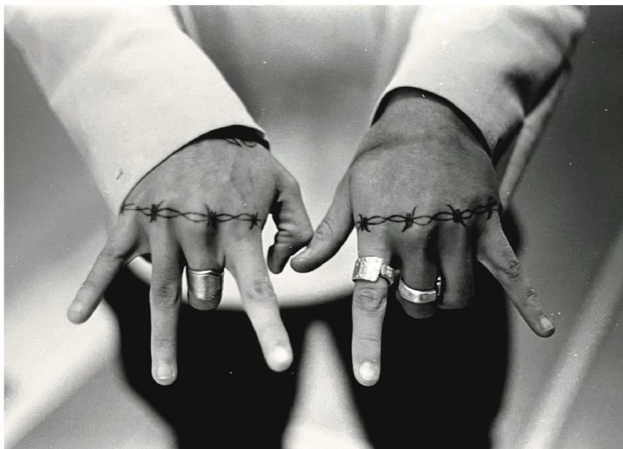
Valentina Vidali – Source of Creation