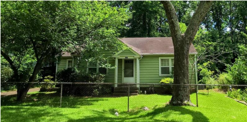
Front of Structure - Front Elevation