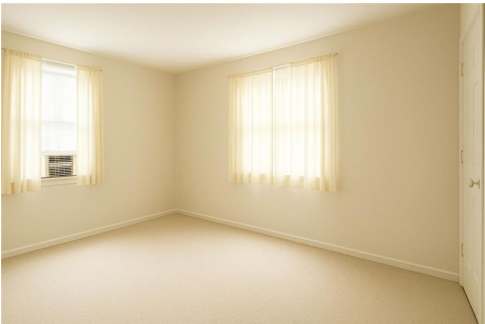
Other - Oversized Den