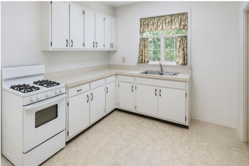
Side of Structure - Left Side of Home