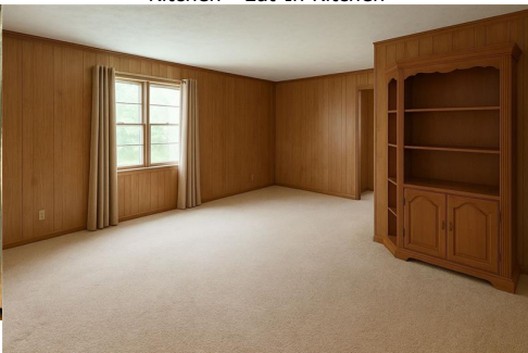
Kitchen - Eat-In Kitchen