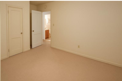
Den - Oversized Den