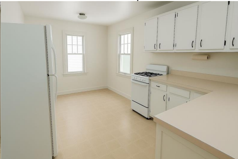
Yard - Backyard