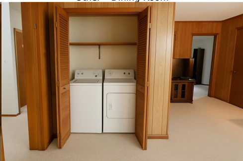
Other - Dining Room