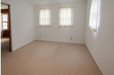
Other - Bedroom 3A