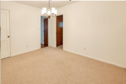
Entry - Living Room