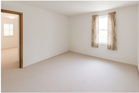
Other - Bedroom 2A