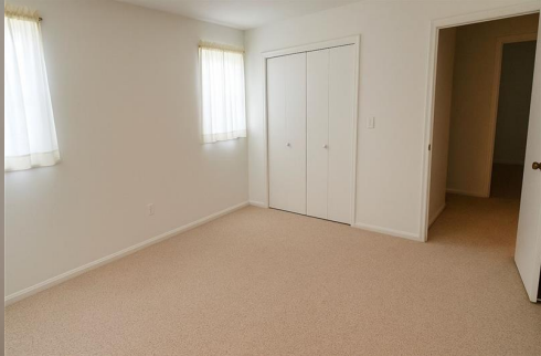
Bedroom - Bedroom 3B