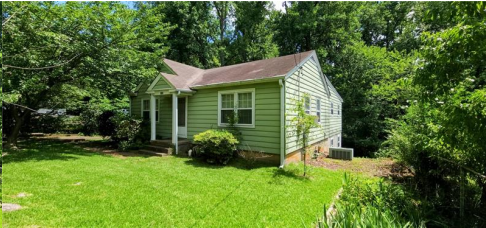
Front of Structure - Right Side of Home