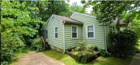
Side of Structure - Left Side of Home