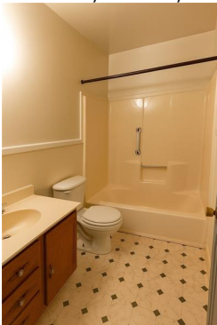
Laundry - Laundry