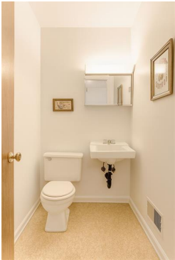
Bathroom - Half Bath