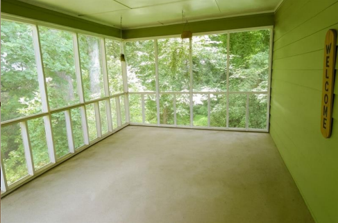
Sun Room - Screened Porch