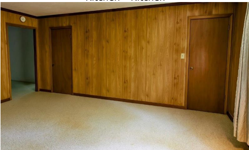
Kitchen - Kitchen