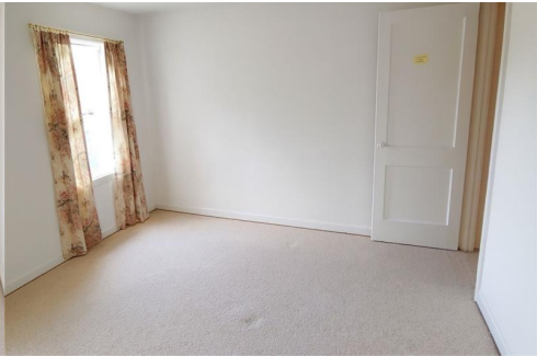
Other - Bedroom 2B